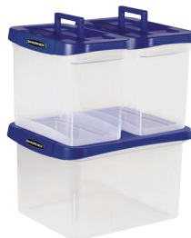
HEAVY DUTY Plastic File Boxes 0086207/0086302