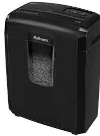
MICROSHRED 8MC Micro-Cut Shredder