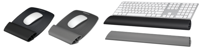
I-SPIRE SERIES™ Wrist Rocker™ and Keyboard Wrist Rocker™