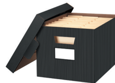
DECORATIVE PINSTRIPE Letter/Legal File Box 0029803