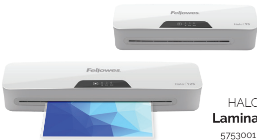
HALO™ Laminators 5753001 - 95 5753101 - 125

If you laminate for company events, office signage or handouts, don't miss a beat in your laminating workload. Home laminators are compact and portable and provide high quality laminating results while saving space.