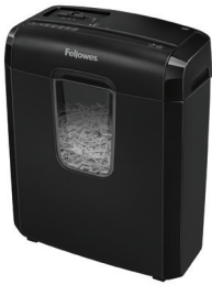
POWERSHRED® 6C Cross-Cut Shredder 4771502

The risks of identity theft remain even when you work remotely. If you're managing confidential documents from your home office, be sure to follow your company's document destruction policy. Cross cut and micro cut paper shredders provide the highest levels of security. Find one that fits your home office.