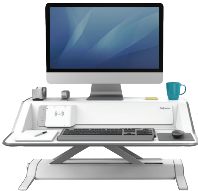
LOTUS™ DX Sit-Stand Workstation 8080201 - White 8080301 - Black

Sitting for hours may feel productive but limited physical activity during the workday can drain your energy, morale and your performance. Go for a short walk or stretch. You can also use a standing desk in your home office to keep you moving.