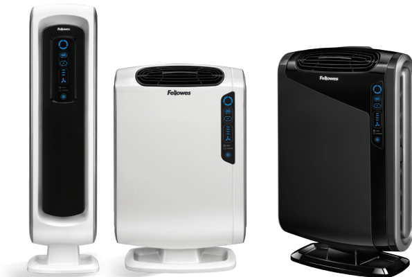
AERAMAX® Air Purifiers

It's important to keep your home office clean especially during flu outbreaks. Use a HEPA air purifier to consistently and effectively clean the air the air of viruses, germs, bacteria and other airborne pollutants.