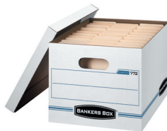
STOR/FILE™ BASIC-DUTY Letter/Legal File Box, 00772