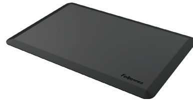
ANTI-FATIGUE Wellness Mat 8707002 - Black