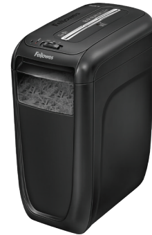
POWERSHRED® 60Cs Cross-Cut Shredder 4606004