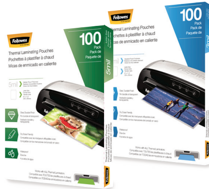
THERMAL LAMINATING Pouches - Letter 5743301 - Letter, 3 mil, 100 pack 5743501 - Letter, 5 mil, 100 pack