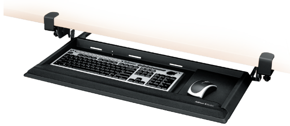
DESIGNER SUITES™ DeskReady™ Keyboard Drawer 8038302

When you're more comfortable, you're more productive, especially when it comes typing and mousing. Select an adjustable keyboard tray that accurately positions your keyboard and choose a wrist support to help prevent wrist strain.